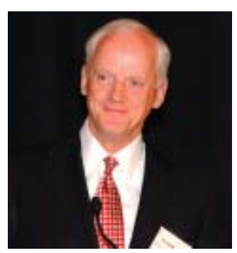
Governor Frank Keating, president and CEO of the American Council of Life Insurers (ACLI).

["Preserving the System" continues from page 1]